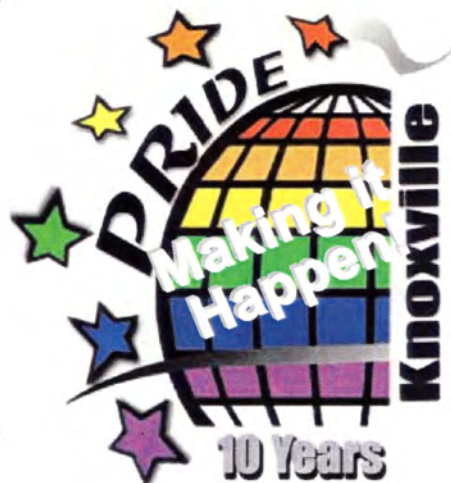
Interesting Developments