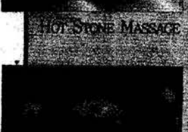
HOT STONE MASSAGE